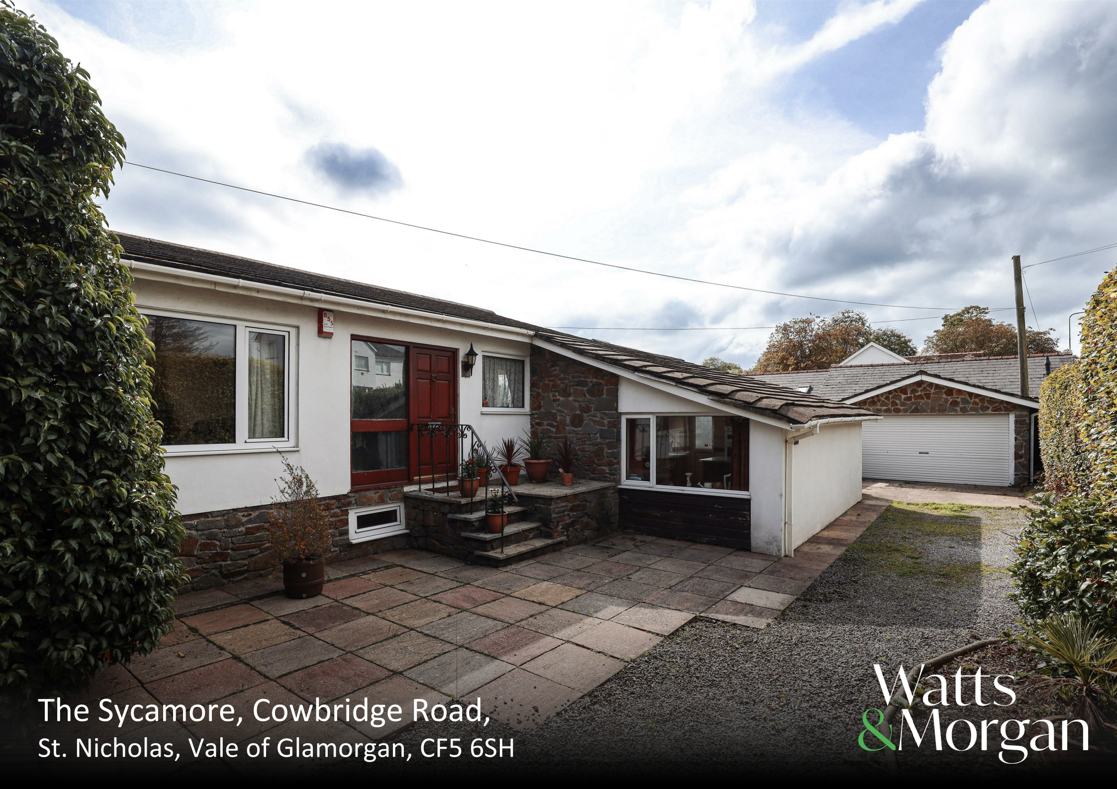
The Sycamore, Cowbridge Road, St. Nicholas, Vale of Glamorgan, CF5 6SH